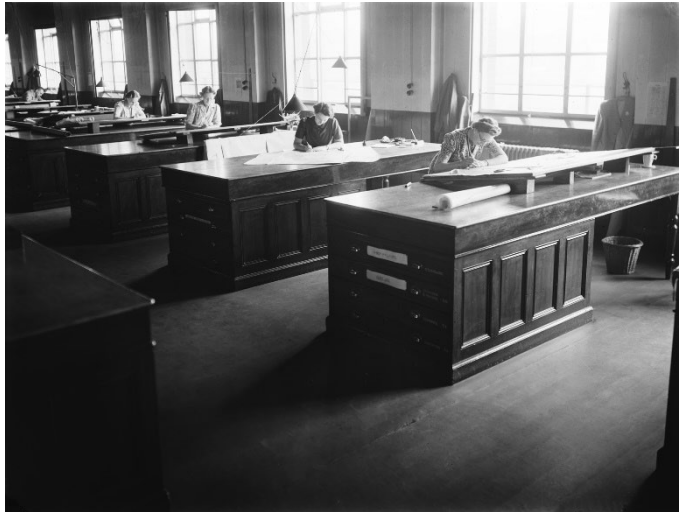
Draughtswomen in Doncaster railway works, 1944

This research guide aims to help you find your way around the collections and find the engineering drawings you are looking for. As most of the drawings we hold are for railway vehicles, we will concentrate mainly on how to find drawings for railway vehicles - locomotives, carriages and wagons. However, the advice here can be applied generally to help find any type of drawing and the table at the end of this guide includes details of collections that contain civil engineering and architectural drawings.