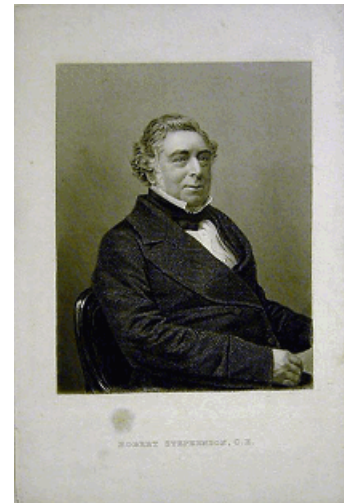
Lithograph. Portrait of Robert Stephenson, Vice President of the Institution of Civil Engineers. From a daguerrotype by Kilburn, Photographer to the Queen. 1977-7331 NRM; SE; PSS; PPI3; D217